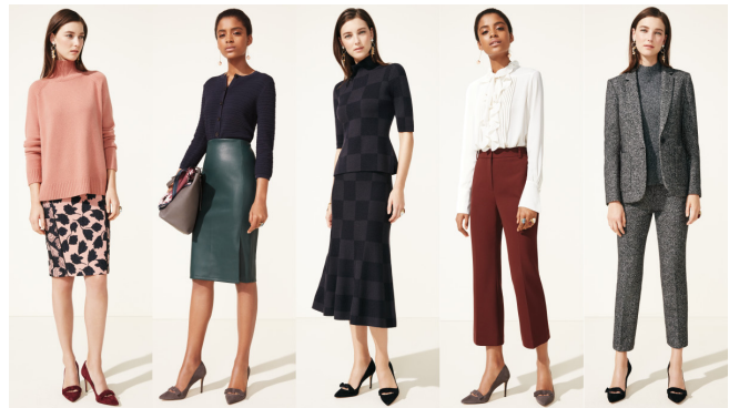
Figure 1. Example of fashionable outfits from Fashionista. 1

Fashion recommendation systems hence entail two main requirements: 1) the compatibility of items in the recom-